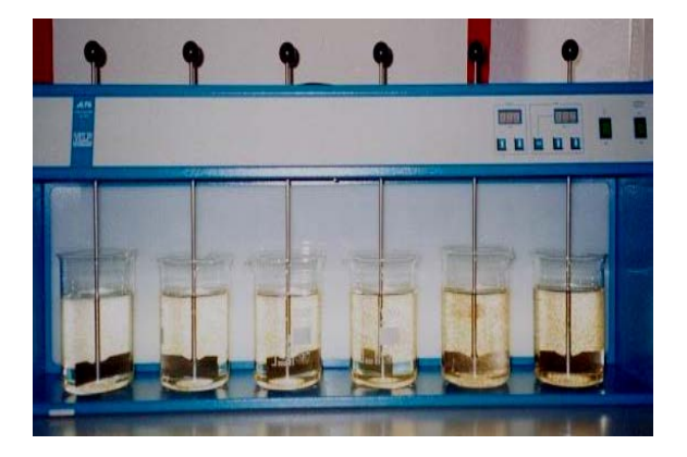
Fig. 1. Jar test apparatus

through the use of different coagulants (FeCl<sub>3</sub>, PAC and Al_2(SO_3)_4 ) and flocculants for the removal of cyanobacteria by means of coagulation/flocculation/sedimentation.